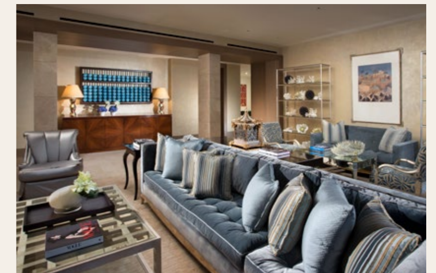
Presidential Villa (3,300 sqm)