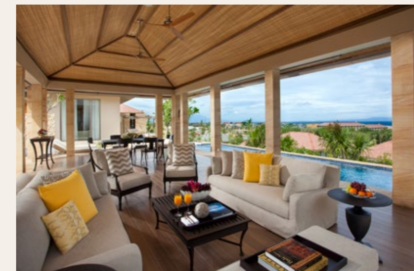
Family Villas — 600 sqm Two-bedroom layout ideal for families.