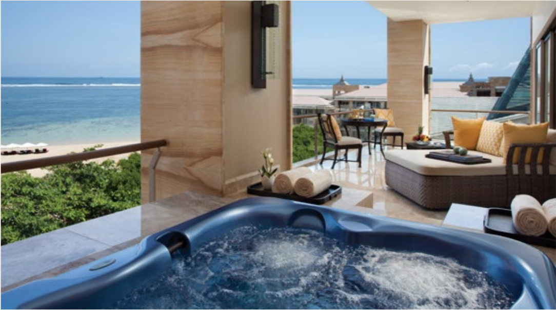
Grandeur & Signature Rooms — 59 sqm Spacious rooms with garden, courtyard, or lagoon access.