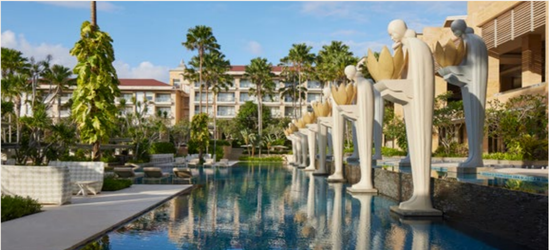
Ladies Courtyard Pool

Dedicated pool exclusively for female guests.